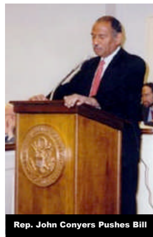
Rep. John Conyers Pushes Bill

groups and labor leaders; local community events; a curriculum for campus activism; a national petition; as well as national ad and internet campaigns pushing for the passage HR676 (Universal Healthcare Bill introduced by Representative John Conyers, who is publicly supporting these hearings and encouraging Members of the House to attend). (Source: www.cnhpnow.org)