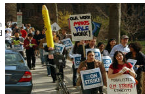
Organizers Rally in New York

union umbrella, organizers anticipate victories. Rather than dealing directly with individual administrators, the strike (4/18)